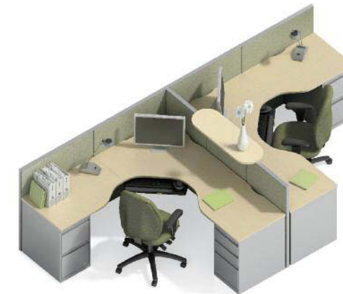
Collaborative Workstation shown with transaction top

A versatile product with many small office applications.