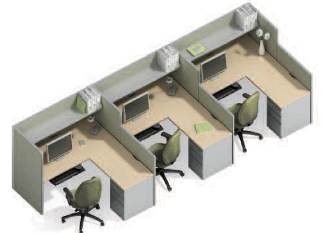
Customer Service Workstations shown with bookshelf

66" panel configurations allow the user to build private or semi-private offices for executive, management and reception areas that maintain privacy.