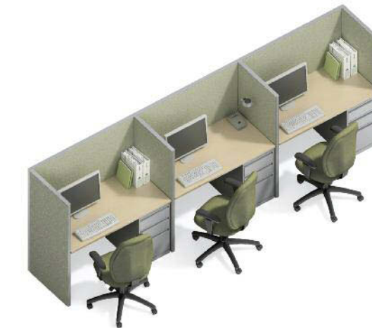
Telemarketing Workstation with a pedestal supported work surface