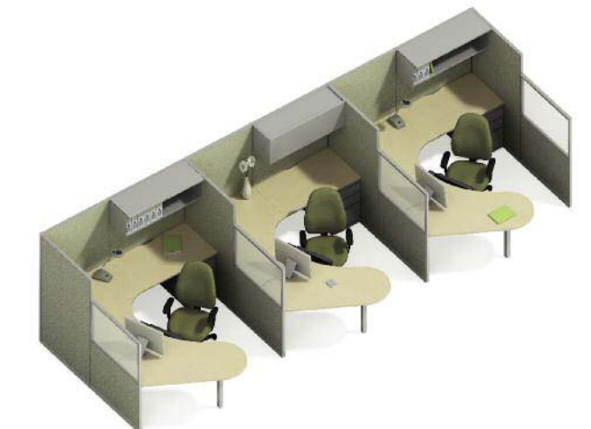
Travel Agent Workstations

Panels and ergonomically designed worksurfaces are configured to provide ample space and privacy for individual tasks in an open office while facilitating occasional group interaction.