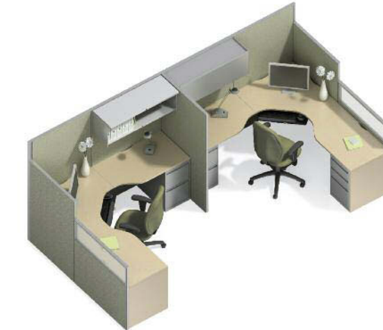
Double Clerical Workstation shown with overhead storage