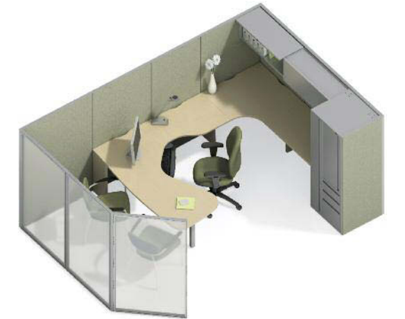
Management Workstation with frosted panel for privacy