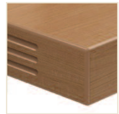
1 1/2" with fluted edge (CF)