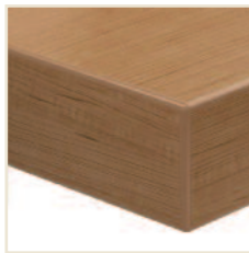
1 1/2" with 3mm edge (C3)