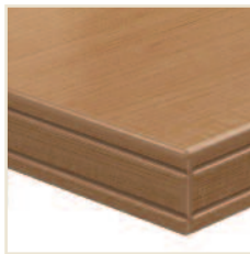
1" with bicut edge (AR)