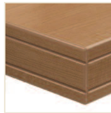
1 1/2" with bicut edge (CR)