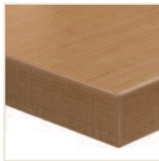
1" with 3mm edge (A3)