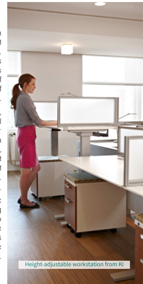
Height-adjustable workstation from KI

Visit the ROSI downtown Houston or Stafford showroom for a firsthand look at our Work Fit line of products including Focal Upright (shown left). We will help you create the best layout and find office furniture you and your employees need. A healthy, happy and productive workforce for a healthy bottom line.