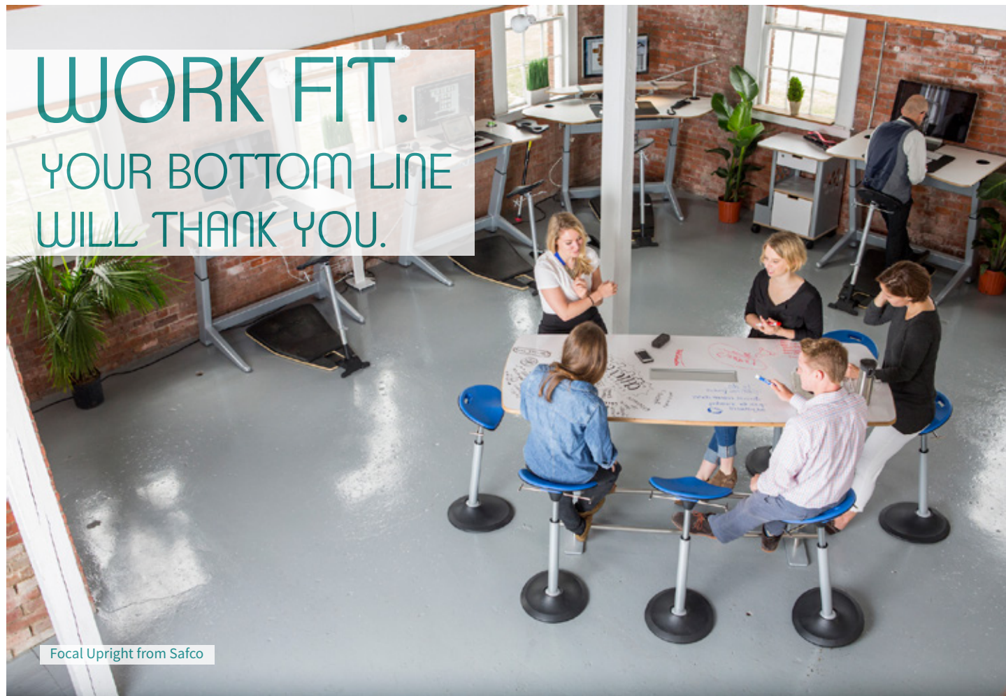
Focal Upright from Safco