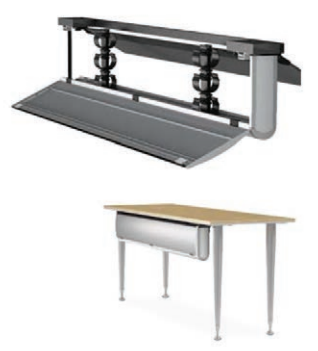
Aluminum laminate face panels