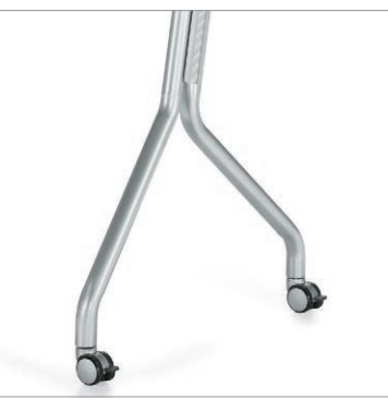
Spider legs with optional locking casters (Bungee)