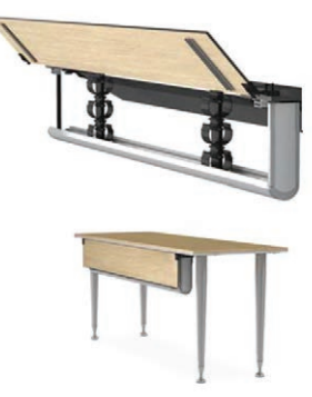
Laminate face panels