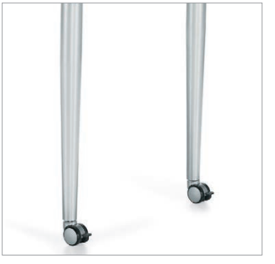
Tapered legs with optional locking casters (Bungee)