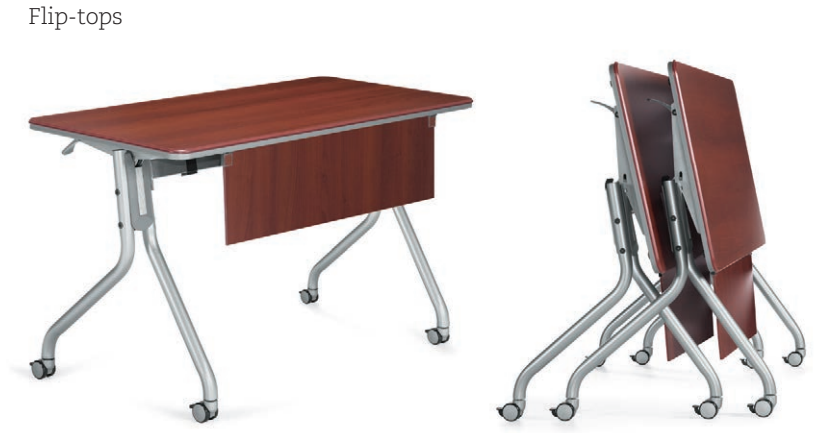
Easy to operate flip-top lever, left or right side