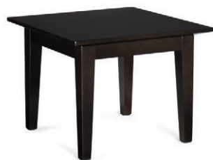
3374-W End Table with wood top.