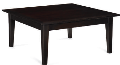
3375-W Coffee / Corner Table with wood top.