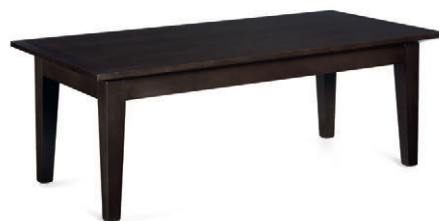
3376-W Coffee Table with wood top.