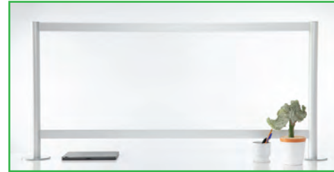
Large: 59" w x 28" h x 6" d