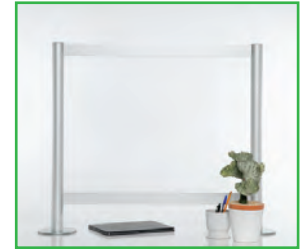
Small: 28" w x 28" h x 6" d