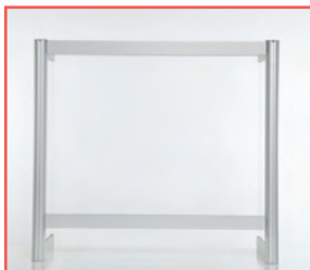
Small: 28" w x 28" h x 12" d