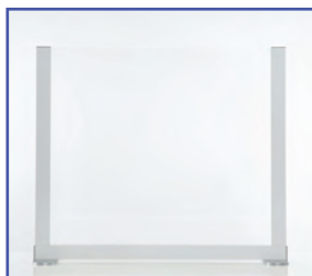
Small: 28" w x 28" h x 6" d