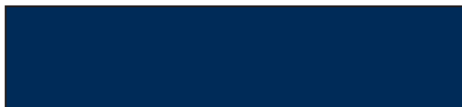
Liberty Blue 1567600