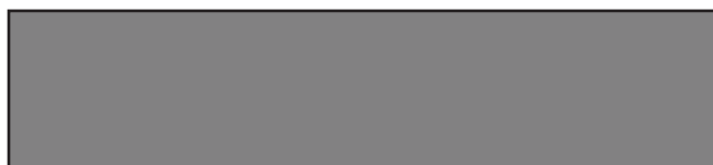
Battleship Gray 1567800