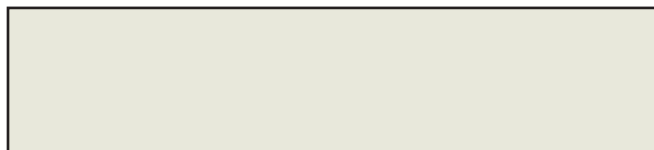
Light Neutral 1568100