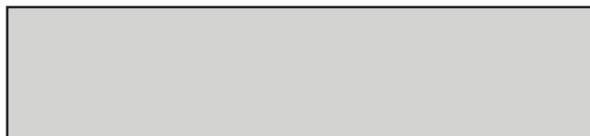
Glacier White (standard color) 1566200

and specification. Color samples of hybrid epoxy powder-coated metal are available upon request.